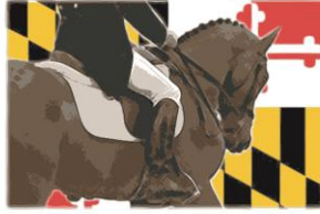
The Highlands at Loch Moy Farm